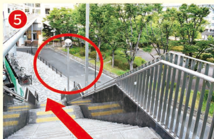
The "boarding area" is at the bottom of the stairs.