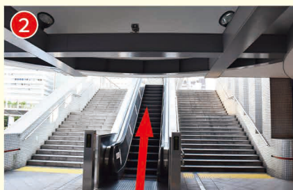
Go up the escalator at Exit 4 to the pedestrian bridge.