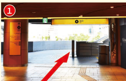
Exit the northwest ticket gate of Shin-Osaka Station on the Osaka Metro Midosuji Line and proceed to Exit No. 4.